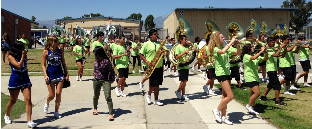
Chino High Band and Color Guard marches across campus, leading students out of their classrooms at the end of the first day of school.