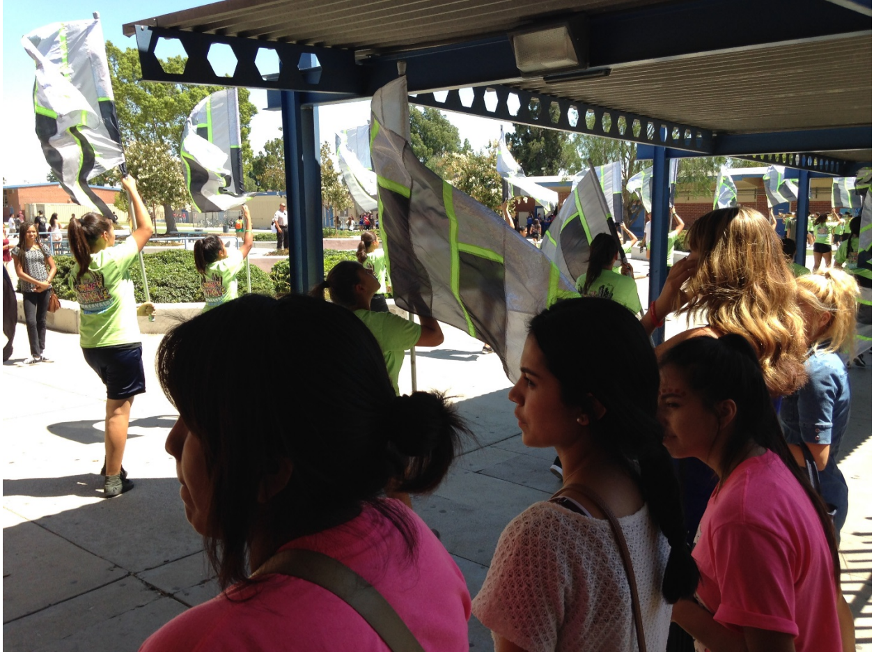
Chino High students watch as the school's Color Guard marches by during a recessional at the end of the school day today (Monday, Aug. 15).