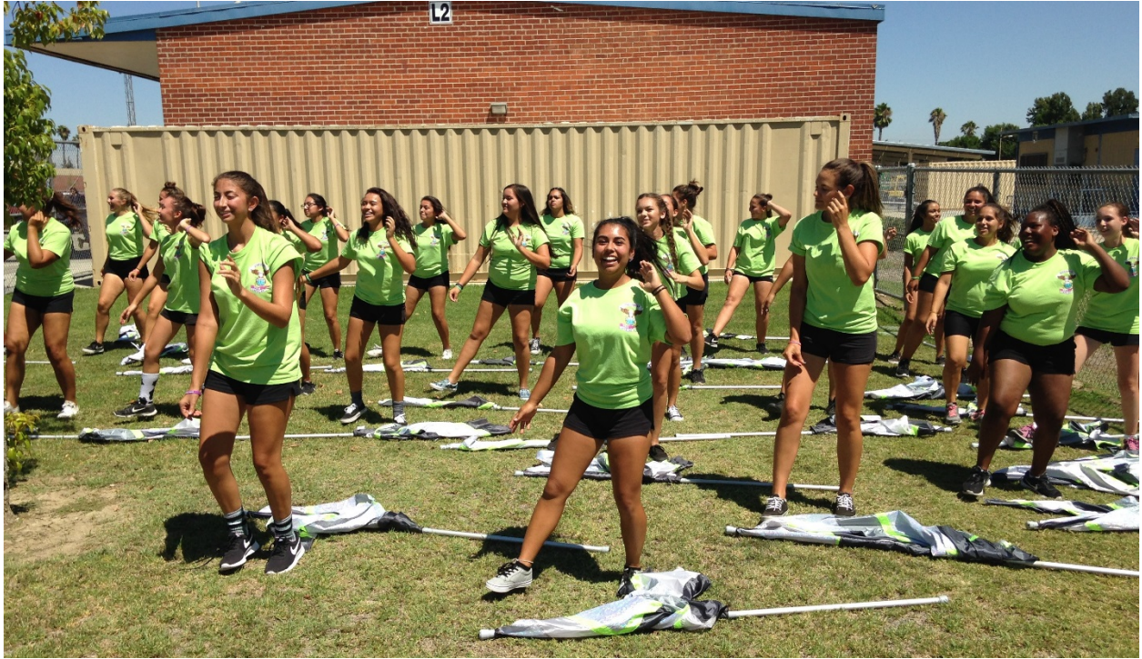
Chino High Color Guard members dance as part of their performance on the first day of school today (Monday, Aug. 15).